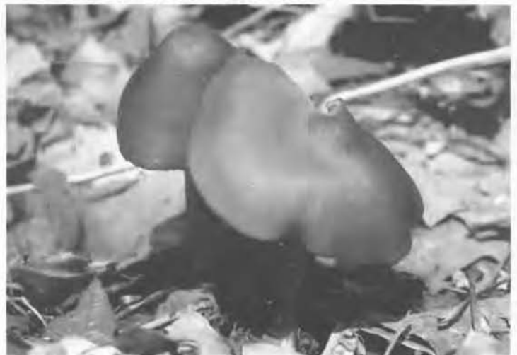
( Nolanea verna )

The Early Spring Entoloma often has a little nipple in the center of its cap. The caps and stalks are tannish brown colored and the gills become pinkish colored with age. It grows on the soil and it is often found when hunting morels. This mushroom is poisonous.