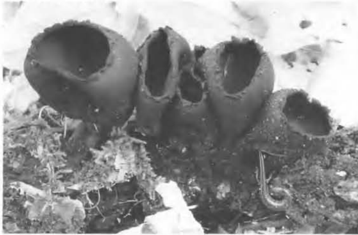
( Urnula craterium )

The Devil's Urn is found on the ground typically growing on small pieces of dead branches that can often be buried. It is typically blackish colored but often has dark brown tones inside the cup. These mushrooms are usually about 1 1/2 to 3 inches tall and 3/4 to 2 inches wide. Its edibility is unknown but it does not look at all appealing. They are often found while morel hunting.