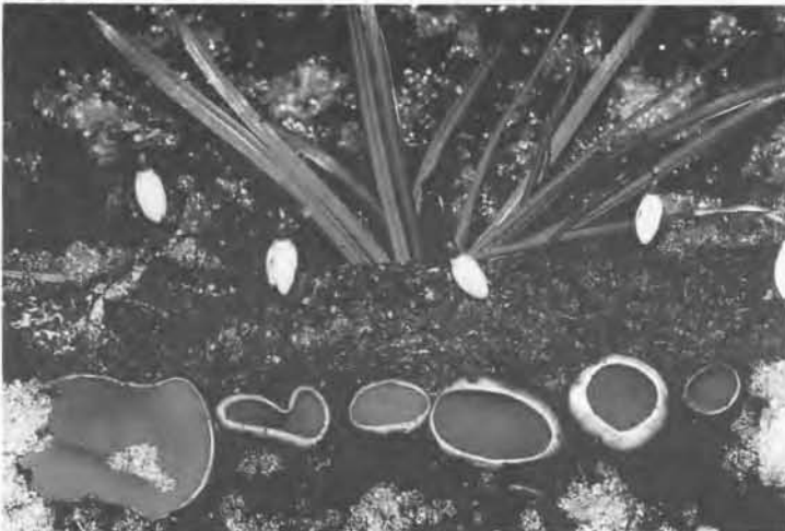
( Sarcosypha dudleyi )

The Scarlet Cup is found on the ground typically growing on pieces of dead branches that can often be buried. It is scarlet red colored in the center but is usually much lighter on the sides that are typically off white colored. These mushrooms are usually about 1/2 to 1 1/4 inches tall and 3/4 to 3 inches wide. In the past the Scarlet Cup went by the name of ( Sarcosypha coccinea ) but that species only grows in the western states. Here in the east we have ( Sarcosypha dudleyi ) and ( Sarcosypha austriaca ). They can be found when morel hunting. Its edibility is unknown.