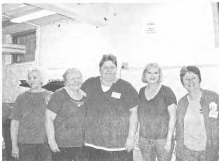
Congratulations! Our MM cooks prepared a fine fungal feast.