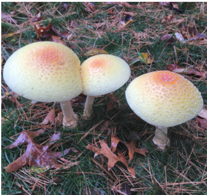
Amanita muscaria var. guessowii is one of the gilled mushrooms you should learn to identify.

How was it growing? Was it growing on the ground, in grass, in mulch, on other mushrooms, or in forests near specific trees? I can almost guarantee if you find a Fly Killer Amanita ( Amanita muscaria var. guessowii ), it will be near evergreen shrubs or under bigger pine or spruce trees.