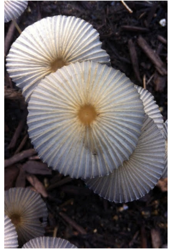
from the 2015 photo contest...