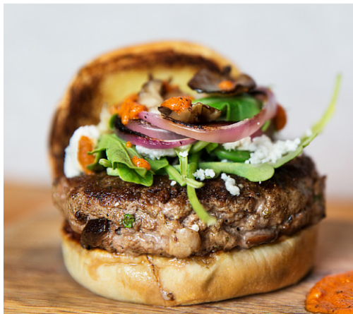
Lamb Burger

THIS JANUARY MARKED the 100th year of the Pennsylvania Farm Show, the nation's largest indoor agricultural event. One of the most popular attractions at the Farm Show is the Food Court, which offers a variety of Pennsylvania products.