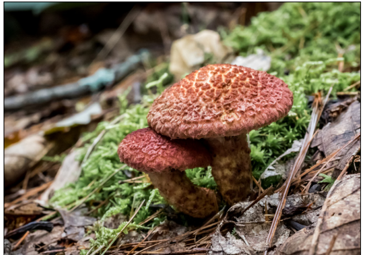
Leucopholiota decorosa