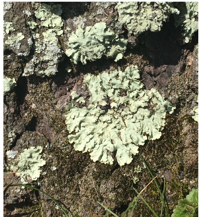
WPMC's annual Photo Contest has historically included slime molds along with mushrooms, but not LICHENS—until now!