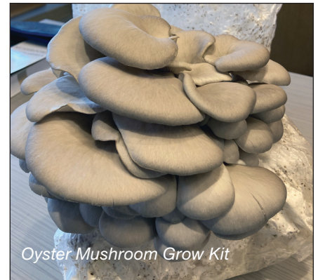
Oyster Mushroom Grow Kit

Frick Environmental Center observes the following Covid protocols, according to the level of community spread in Allegheny County: Masks are OPTIONAL when the level is LOW, RECOMMENDED when the level is MEDIUM, and REQUIRED when the level is HIGH.