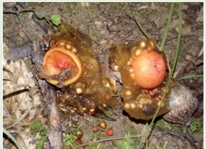
First Place Judge's Option: Patty Houck, Calostoma cinnabarinum