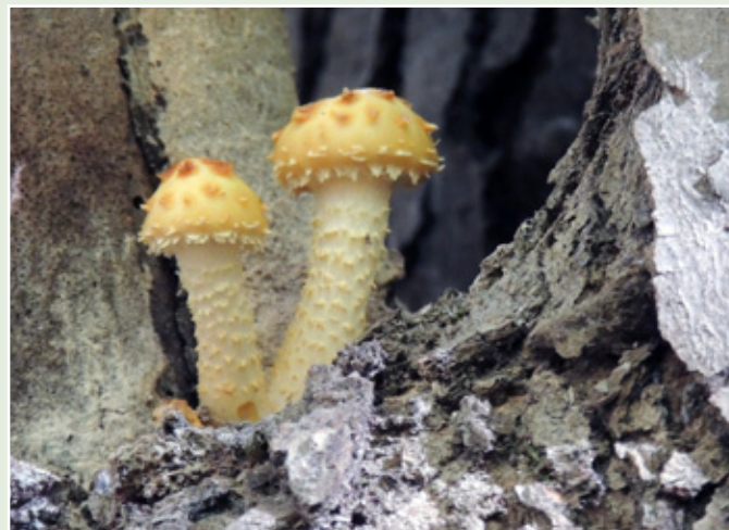
Second Place Judge's Option: Lynn Gill, Pholiotas (2 photos)