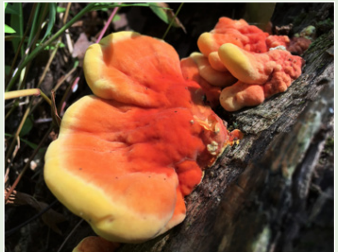
Second Place Pictorial: