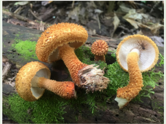
First Place Pictorial:

For the last meeting of the year, I invite you to join us for a Potluck Dinner at Beechwood Farms, along with awards and a slide show of members' pictures. Have a great winter, and I look forward to seeing all of you in the Spring for Morel season. I hope that it will be as good as this year's!