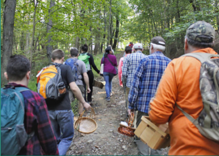
Foray attendees chose from five different morning mushroom walks.