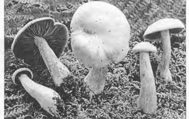
Laccaria ochropurpurea are among my preferred edibles. Like the Blewit, care must be taken not to confuse it with a possibly poisonous Cortinarius. Its white spore print differs from a Cort but can occasionally have a hint of light purple. Its purplish cap will fade but its gills will remain purple. I often find it under oak trees but it also grows under other kinds of trees.