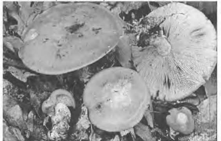
Blewits have a pink spore print, likes to grow in leaves in cold weather, and can have a purple cap.

Blewits (<u>Clitocybe nuda</u> = Lepista nuda, Tricholoma nudum, Rhodopaxillus nuda)