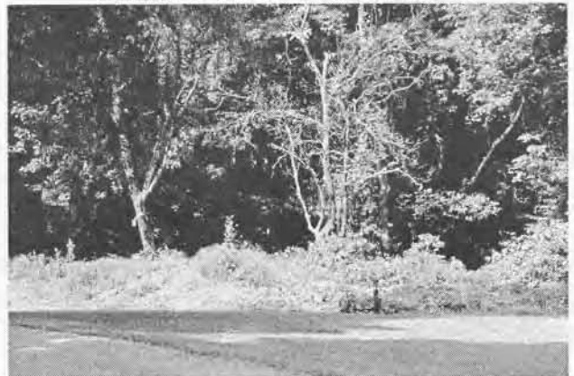
My favorite place to look for blewits is around the wooded edges of parks and cemeteries where they dump leaves from the previous year. Current year piles are not productive, nor are piles in full sun.