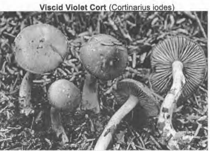
The Viscid Violet Cort has a rusty colored spore print. Its gills can be covered by a cobweb veil only when young. They should not be considered for the pot.

Microscopic Features: The spores do not react with iodine.