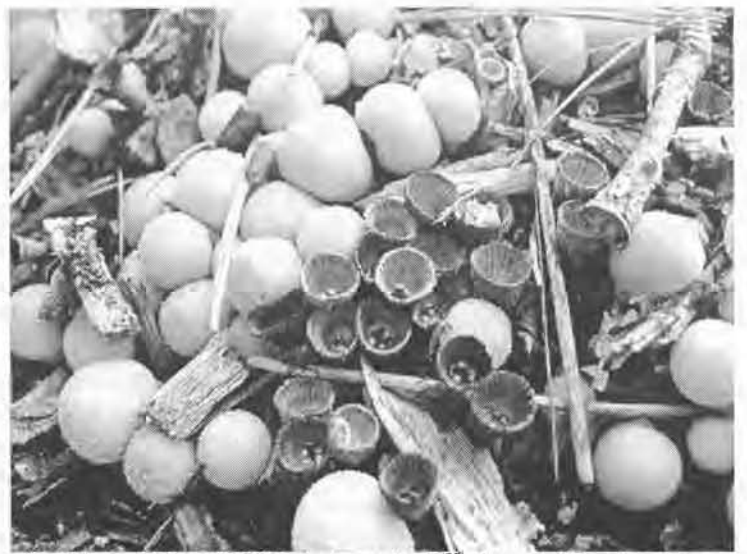
"Pebbles and Cups", 2005 photo contest 2" place digital entry winner.

Use of Images/Reproduction: By entering the contest you give the WPMC permission to duplicate and use the entered images for club purposes, to manipulate the images, and to transfer and/or use the images in other formats. The contestant will retain ownership and copyright of the images but will grant the club their use. Possible club uses may include, but are not limited to, use by the education committee, walk and forays, program, newsletter, and webmaster.