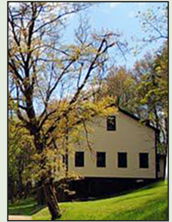
North Park Parish Hill