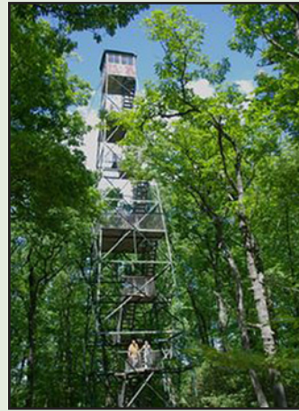
Cook Forest Fire Tower