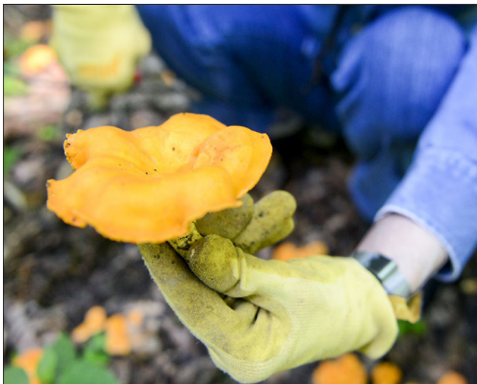
The Western Pennsylvania Mushroom Club found a large patch of Chanterelles minutes into a mushroom walk in Salamander Park in Fox Chapel July 11.