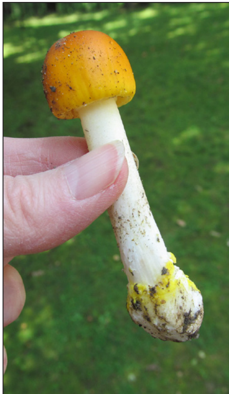
CENTER: Amanita flavoconia does not have a sac and leaves "yellow patches" on the stem.