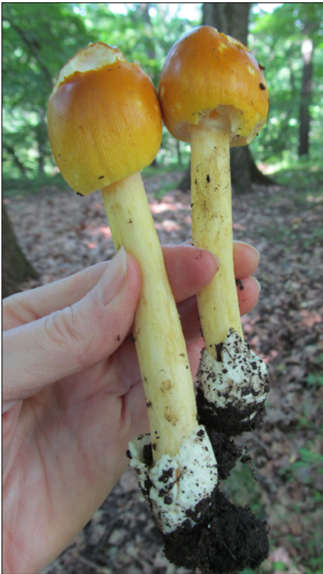
LEFT: Amanita banningiana has a distinctive volva or sac.