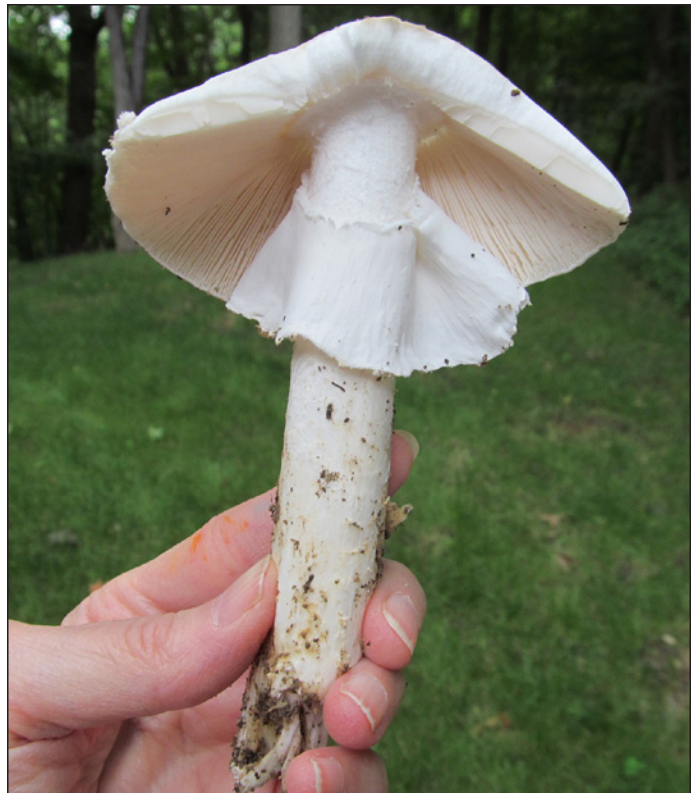
The Destroying Angel has a prominent ring.