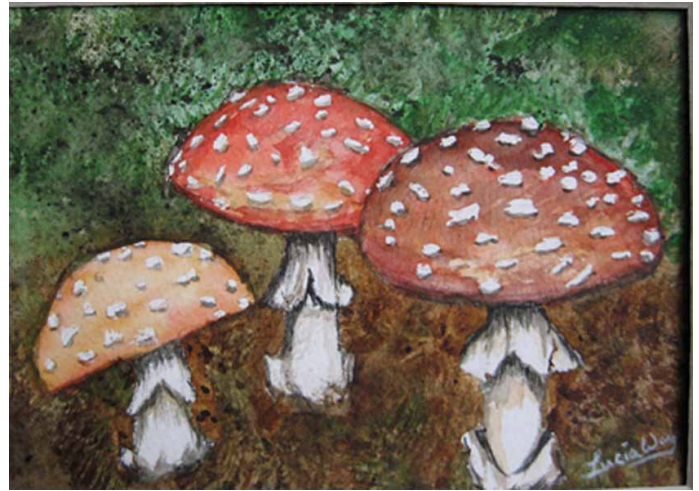
Print of Amanita muscaria watercolor by Lucia Wong Yip

To see Lucia's work, visit: https://luciwongy.wordpress.com/watercolor-paintings-of-wild-mushrooms/