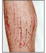
These whiplash marks appeared on a 25-year-old Brazilian male who had eaten raw shiitake mushrooms.

SHIITAKE ( LENTINUS EDODES ) DERMATITIS is a rare skin eruption that resembles whiplash marks and occurs after consumption of raw or insufficiently cooked shiitake mushrooms. The condition was first reported in Japan in 1977. Since 2006, new cases have been reported every few years, from around the world.